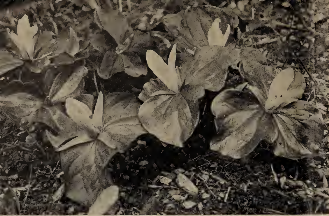
Trillium sessile increases and becomes more valuable year by year.